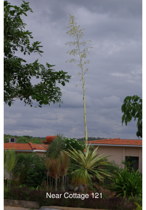
Near Cottage 121

As some of you may have noticed, quite a few varieties of cacti and succulents are growing very well in SUVIDHA, adding to the beauty of the landscape. Truly spectacular among them is this magnificent specimen of Agave americana (aka Agave spectabilis ), which is a part of the rock garden in front of cottages # 121 and # 122. Because of extensive propagation, the plant's exact origin is uncertain but it is now widely believed that it probably came from the arid areas of Mexico. It is a solitary large leaf succulent with a basal rosette which can grow up to 4m in width, with thick massive grey blue leaves which are between 170 cms- 200cms long and around 25 cms wide and have sharp spines in the margins and at the tips. The inflorescence of the Agave americana is branched and can reach very large proportions, soaring 3m to 7m or more in height and bears large yellowish green flowers that measure between 6cm and 10 cms. No photograph (especially the one attached to this mail which was taken this morning which was quite cloudy and hence dark) can really do justice to our home-grown specimen. So, if you happen to be in Bangalore and really wish to see this magnificent specimen, please drop by. It will be worth the visit.