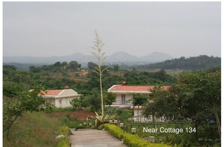
Near Cottage 134