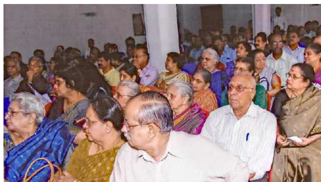
A view of the audience attending the Foundation Stone Laying ceremony of Suvidha Hospital