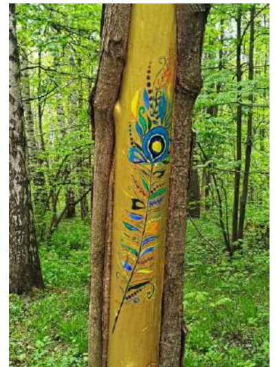
Tree art in a park in Moscow

Kala Sundar (Cottage 15C) lives in Bangalore