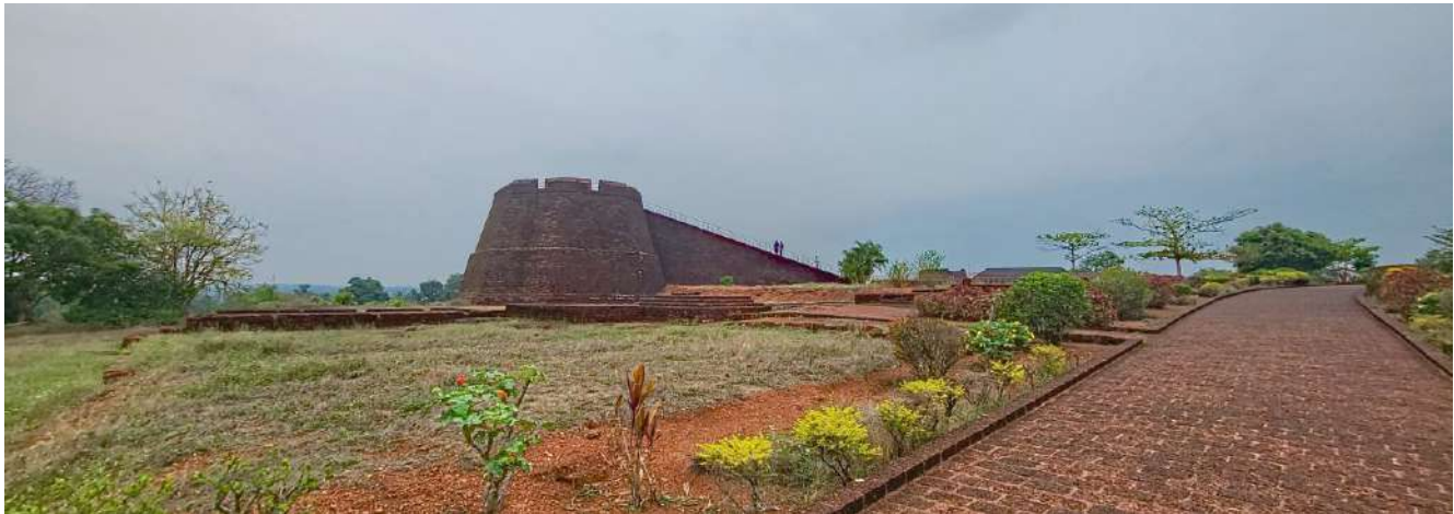
The fort's zigzag entrance and surrounding trenches reveal its defensive strategy

The historic fort is surrounded by a beautiful