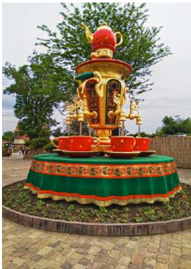
Stylised samovar in a park

goods, fast foods and electronics have left and all kinds of shortages are expected. Manufacturing is limping, agriculture is facing a shortage of seeds and cattle feed because of global monopolies, and the service sector has contracted. Job losses have been high in the capital but other cities are not affected so severely. For me, coming from Bangalore, life in Moscow is very comfortable. I drink tap water, walk comfortably all over the city without having to watch for all manner of obstacles. The city is clean, well-lit, safe. Efficient public transport covers every part of the city and taxis are affordable. The freedom to go wherever one wishes to, even late at night, is wonderful, especially for women and the elderly. Moscow is