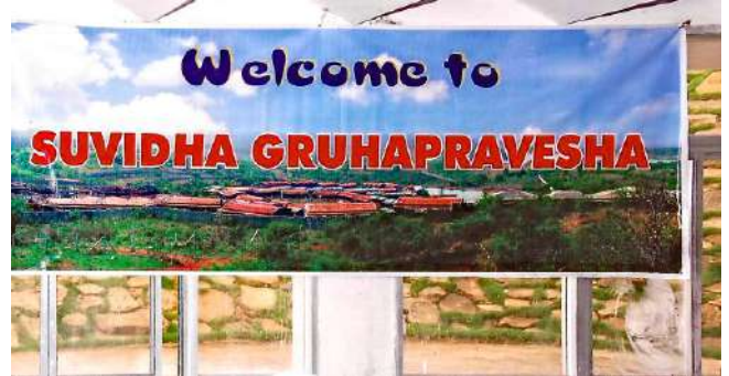
Banner erected on the occasion of Suvidha Gruhapravesha