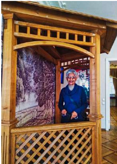
At the gazebo in Goncharov museum

Concerts, visits to museums and art galleries, walking in Moscow's many parks, meeting friends - these are just a few of my outings in the ten weeks that I have been in Moscow. I also took a day trip to Tver, the old