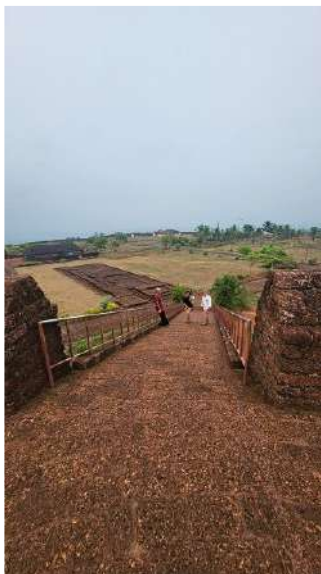
Water-tank with its flight of steps