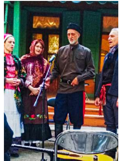
Folk music in the garden of Leo Tolstoy's Home-Museum, Moscow

not abandon our own' is a slogan visible in many places and there is a determination to face down the sanctions. But there is no display of the chest-thumping jingoism that we see even at a cricket match. Most people resent the selective outrage against Russia and the demonisation of Russians. "Do you think we are evil?" they ask, and I can see and feel their pain.