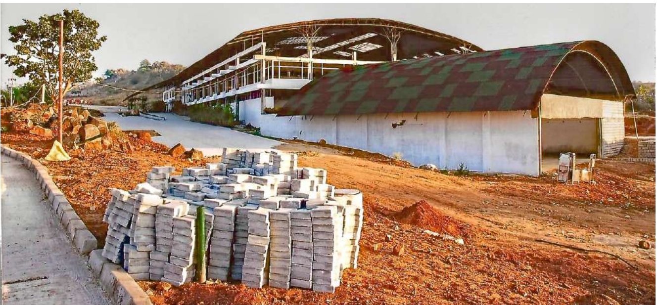
Suvidha Club House and surrounding area in 2010