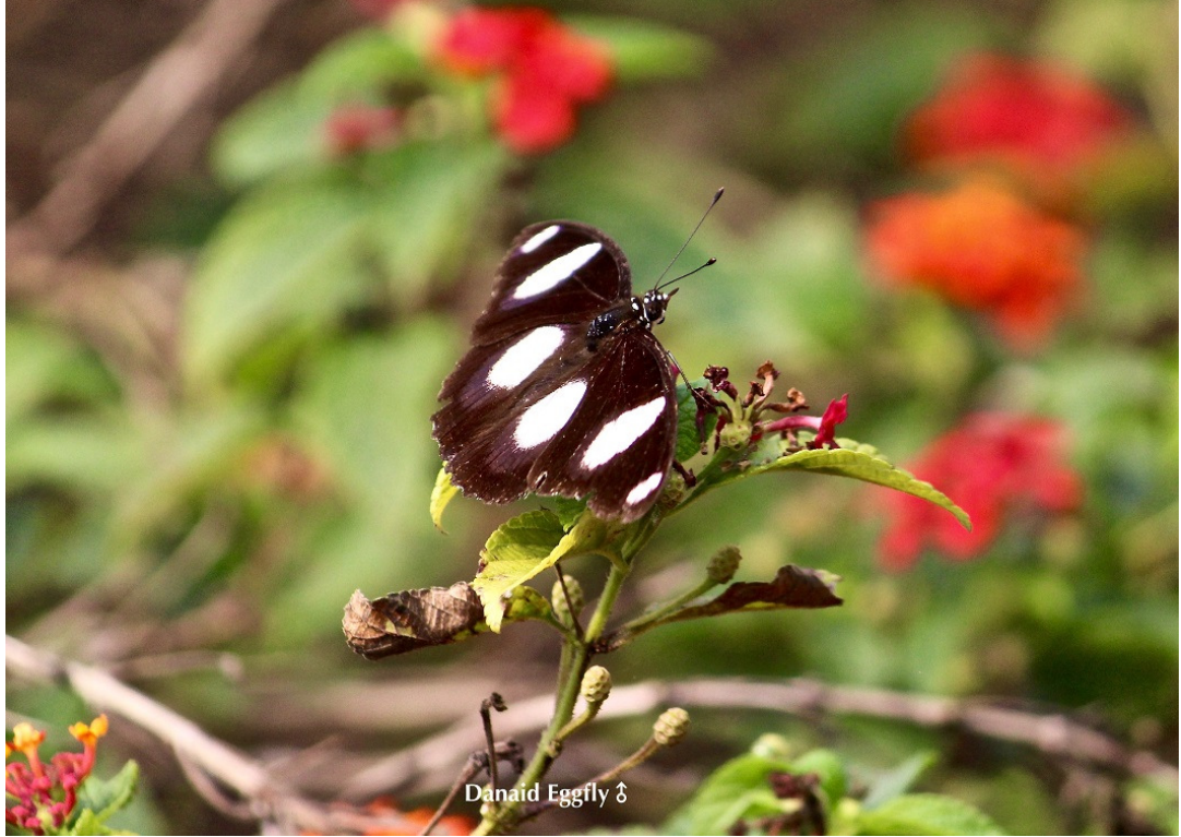
Danaid Eggfly ♂

The species feeds almost exclusively on nectar especially from the now widespread Lantana . The species' favourite larval host plant is Portulaca . The female of the species can be seen circling the host plant, inspecting its phenophase* and checking out if it is safe from armies of ants that can destroy the butterflies eggs and caterpillars as soon as they arrive.